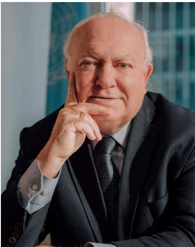
MIGUEL ÁNGEL MORATINOS

*Shortlisted applicants will be interviewed in the final stage of evaluations.