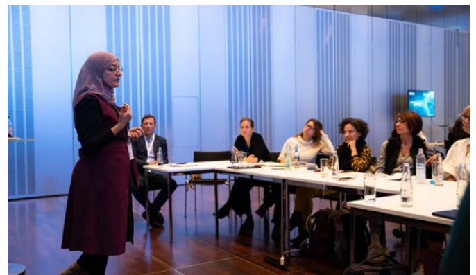
Capacity-building Workshop in Munich, Germany

Projects that have been submitted to previous editions of the Intercultural Innovation Hub (including the Intercultural Innovation Award) and were not selected are eligible and encouraged to apply again.