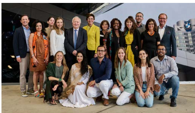
Capacity-building Workshop in Munich, Germany

Clarity: sets clear objectives and draws a logical connection between activities, outputs and outcomes.