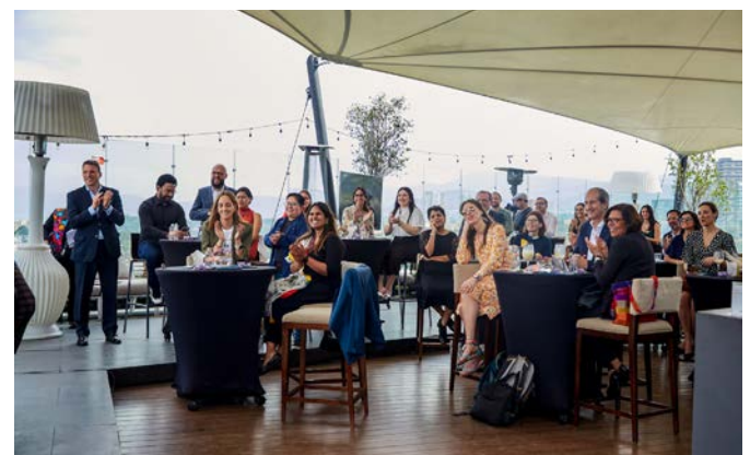
Capacity-building Workshop in Mexico City, Mexico