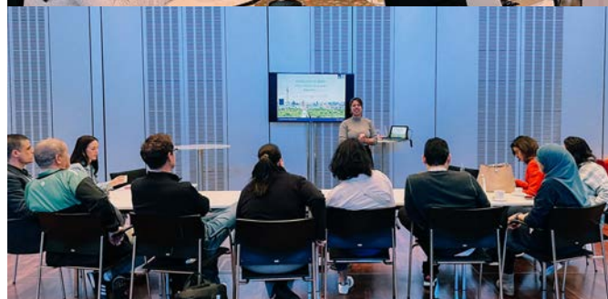
Capacity-building Workshop in Munich, Germany