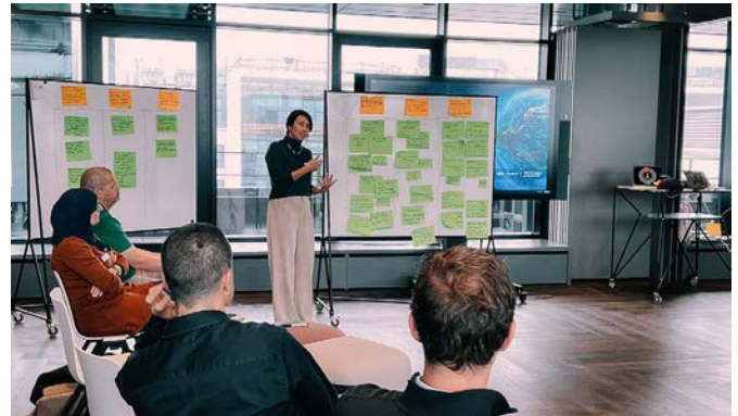
Capacity-building Workshop in Munich, Germany

Innovation: pushes beyond typical approaches and excels in the use of original and novel methods (social media, arts, pedagogical approach, innovative training, etc.).