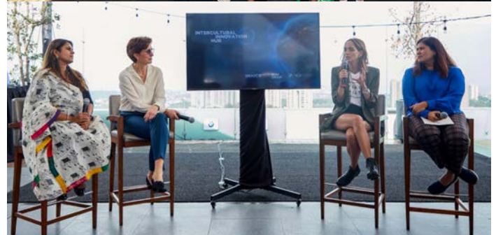
Capacity-building Workshop in Mexico City, Mexico